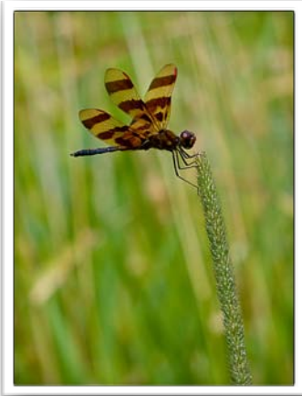
Precarious Perch by Joe Beuchel