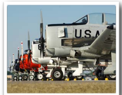
North American T28s