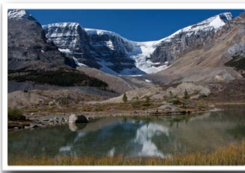
Waterfowl Lake by Diana Jacobson