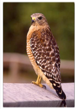
Red Shoulder Hawk