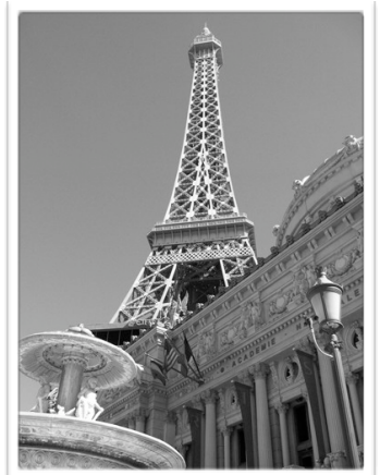
Paris in Las Vegas