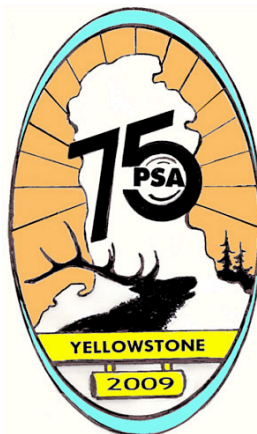
West Yellowstone, Montana September 20 - 26, 2009