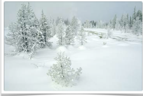
Winter at West Thumb Geyser Basin by Pat Wadecki