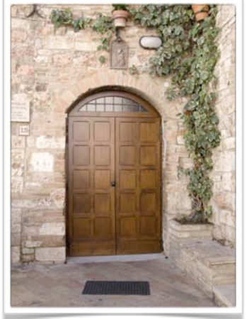
Doors - Assisi, Umbria