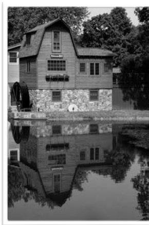
Peterson Mill