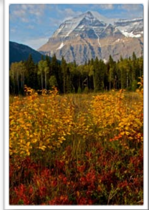
Mt. Robson