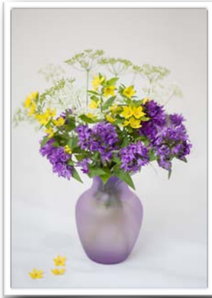
Light Bouquet by Nora Liu