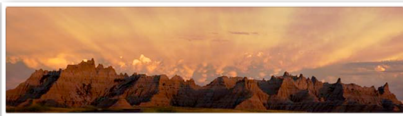
Sunset Over The Badlands by Kent Wilson